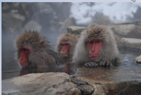
Snow Monkey (~April)