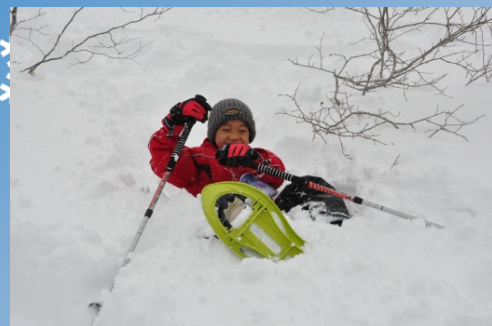
Hakuba area (~May)