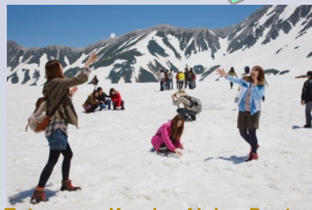
Tateyama-Kurobe Alpine Route "Murodo Area" (~July)