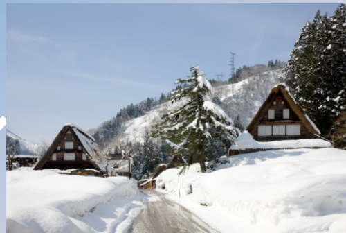
World Heritage Gokayama (~April)