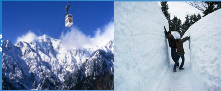
Shinhotaka Ropeway (~April)