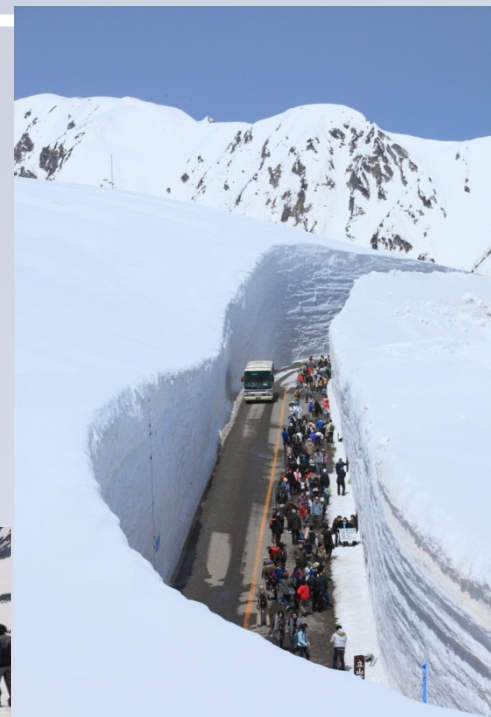
Tateyama-Kurobe Alpine Route snow wall "Yuki no Otani" (~June)