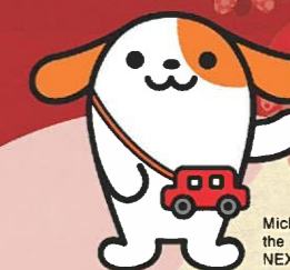
Michimaru-kun, the original NEXCO-Central mascot

Fixed-rate unlimited driving pass for the Central Japan Expressway CEP (Central Nippon Expressway Pass)