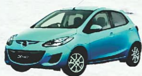
Examples of Rental Cars

Note: Rates are one-way fares without using the CEP, NEP, or AIP. Note: The CEP, NEP, and AIP all use a flat rate regardless of the displayed rate. Recommended tourist spots in Central Japan