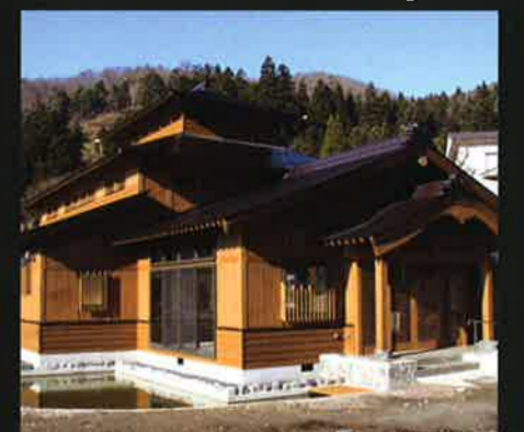
Asagama Hot Springs Park [Furusato-no Yu]