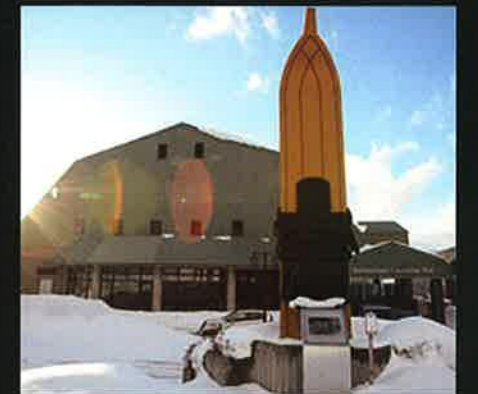
Nozawa Onsen Arena Arena Convention Center [spa facility]