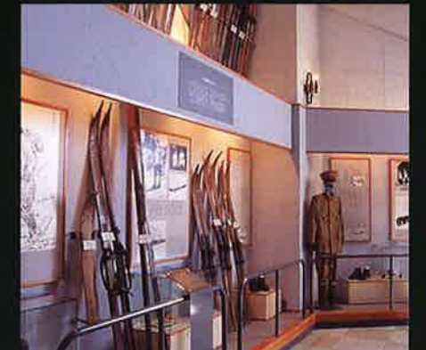
Japan Ski Museum