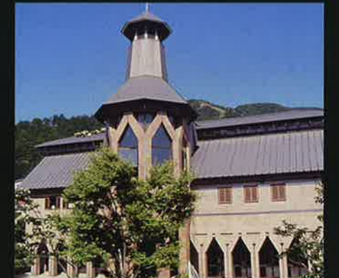
Tatsuyuki Takano museum