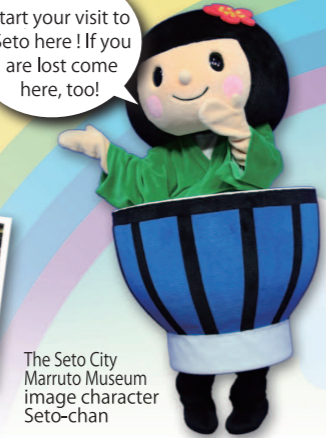
The Seto City Marruto Museum image character Seto-chan

Start your visit to Seto here! If you are lost come here, too!