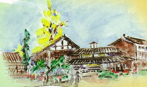
Hida no Takumi Bunkakan