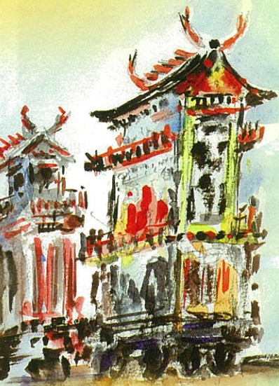
Furukawa Festival Festival float line

2 Hida no Takumi Bunkakan (Hida Crafts Museum) There are exhibits of the Takumi tools and technique, and also a corner where you can actually experience the timberwork in the museum.