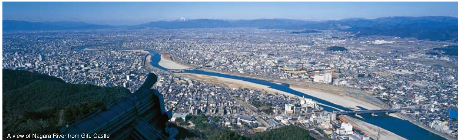
A view of Nagara River from Gifu Castle

■Historical Sites Designated by Gifu City: Remains of Honmaru, Ninomaru, the Upper Lattice Gate, the horse riding ground, the residence of Oda Nobunaga, and Mitarashi Pond.