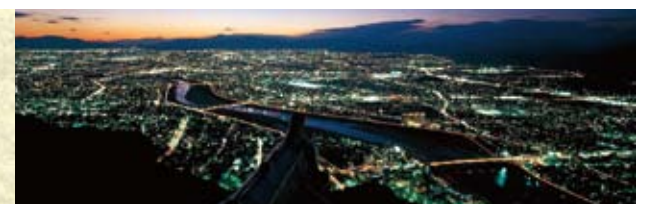
A night view in the direction of the Nagara River, as seen from Gifu Castle

From the highest level, you can take a view of the clear water of Nagara River, famous for its cormorant fishing, which flows through the city. To the East is a magnificent view of Mt. Ena and the Kiso Mountains, and to the North is the mountain range of Norikura and the Japan Alps. To the East are the mountains of Ibuki, Yoro and Suzuka, and to the South is a vast expanse of the grand plain of Noubi, with a view of the Kiso River serenely flowing into the Ise Bay. This grand sight can be enjoyed as Nobunaga had once viewed the world from here. For the pleasure of a night view, opening hours are extended during the summer period.