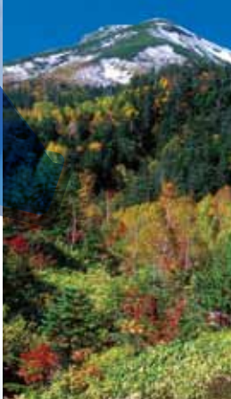
Shirahone hot springs